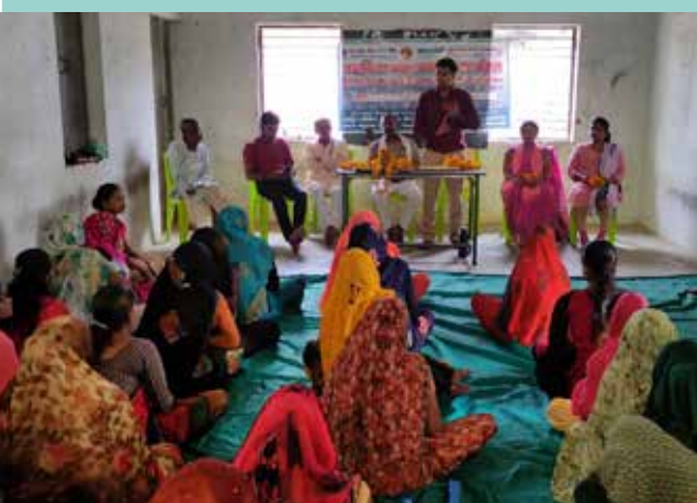
RSETI capacity building training organized for women farmer entrepreneurs.

The synergy between BCFRC and Agri Junctions forms a holistic support system, encompassing processing, storage, and community engagement. This integrated, collaborative approach contributes to the resilience of the local agricultural ecosystem