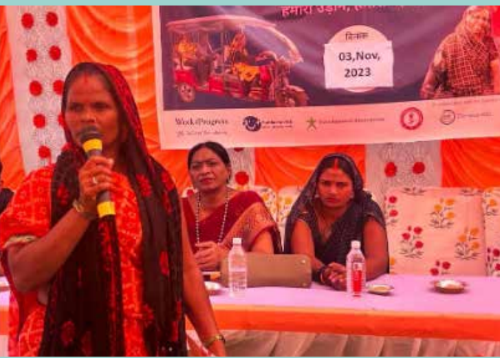
e-Rickshaw entrepreneur raising her concerns in Aarya Manch

The women-led e-rickshaw prototype of Development Alternatives (DA) was co-created with aspiring women entrepreneurs in 2018. During the reflection workshop organised to capture narratives from aspiring and existing women entrepreneurs, they revealed the common challenges faced by them in the e-mobility space.