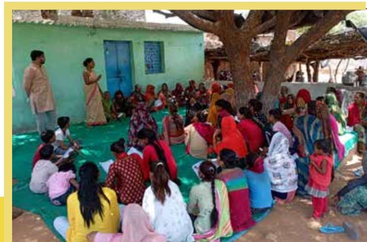
Beneficiaries selection in new villages of project geography.

The ACCESS team met some of the nodal government officials at state, district and block levels. The team held a meeting with Watershed Development & Soil Conservation officials at Jaipur to orient them about the project and understand key interventions of the watershed department in selected project blocks. The team also met the Block level government officials from agriculture and animal husbandry departments to brief them about the project and take their suggestions with respect to relevance of selected blocks and preferred villages. This preliminary engagement with the nodal government departments is helping to build a rapport with them and in incorporating the government. schemes and interventions in selected project geographies. The team hopes to leverage this to build collaborative interventions in the coming months.