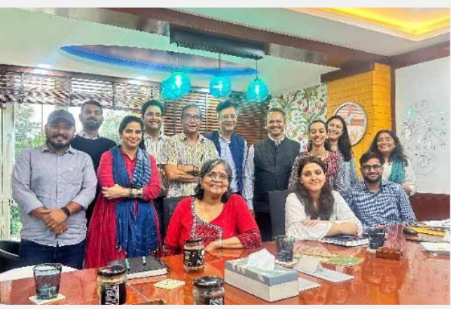
W4P India partners meeting at ACCESS's HQ.

+ ACCESS Development Services (ACCESS) is the newest partner organization in the W4P India network. It is implementing the W4P Program titled ““Work4Progress India (Greenpreneurship: Mainstreaming Sustainable Livelihoods)” beginning from October 2023 in the two districts of Rajasthan i.e., Jaipur and Dausa. The project will reach out to support acceleration of 5 existing prototypes, 1 new prototype (Greenpreneur), 430 new jobs creation and supporting 2,338 existing jobs within 18 months.