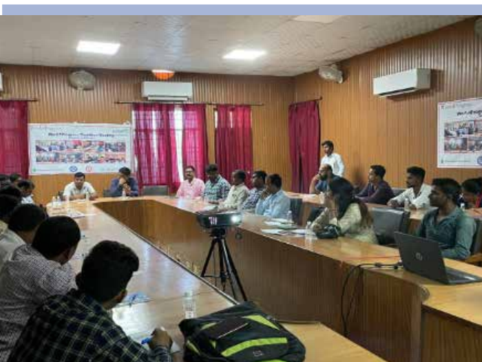
District Entrepreneurship Coalition conducted in Bhadohi, Uttar Pradesh.

The partnership with SBIF has been instrumental in fostering resilient and inclusive livelihood models, nurturing entrepreneurial ecosystems, and forging strategic collaborations. These efforts aim to enhance incomes and uplift marginalized communities, working towards breaking the cycle of poverty in these regions.