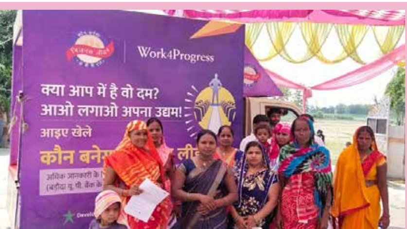
Participants from the KBBL competition conducted by TRI in Basti, Uttar Pradesh

The W4P programme, undertaken in partnership with Development Alternatives, plays a pivotal role in supporting these endeavors. Under this initiative, various government departments, Civil Society Organisations (CSO), bankers, training institutes, and market players were actively involved during coalition meetings. This has helped to foster a collaborative spirit that serves as the driving force behind entrepreneurship.