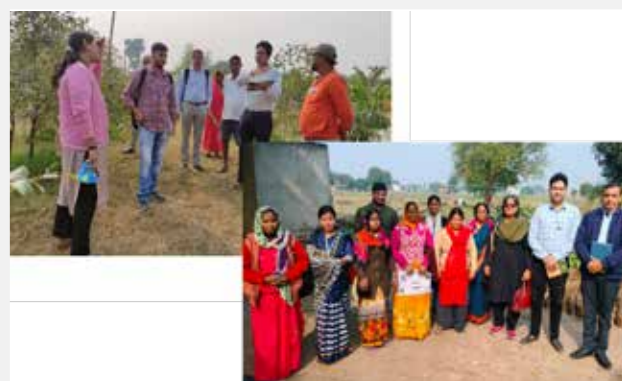
Visit to ActionAid Association and Development Alternatives intervention areas

+ ACCESS hosted W4P India partners meeting at its HQ in Delhi on 31st October 2023. The meeting was attended by representatives from LaCaixa Foundation, the India Platform External co-ordinator, the programme teams of Development Alternative, and ActionAid Association along with the ACCESS team. Key agenda of the meeting was centered around briefing W4P approach to ACCESS team, briefing existing prototypes developed by W4P India partners and planning preparatory and community listening phase activities.